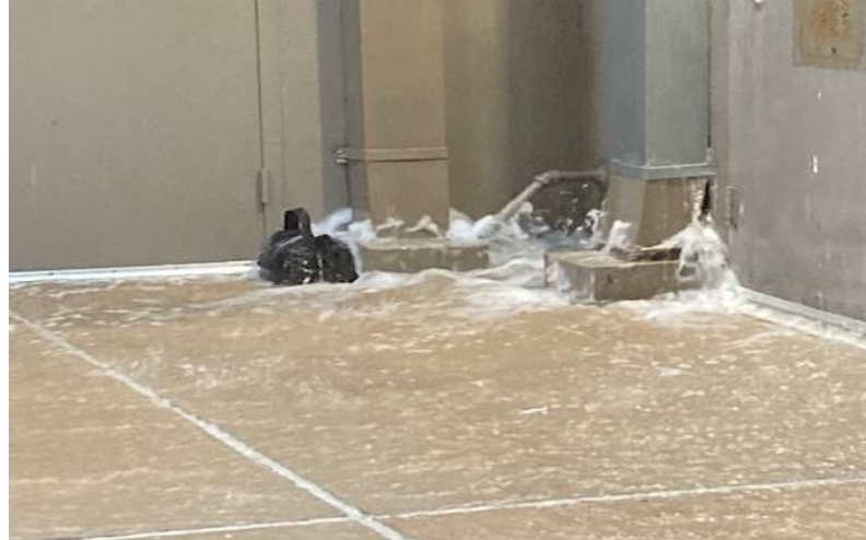
Drainage Issues throughout Rice Village.