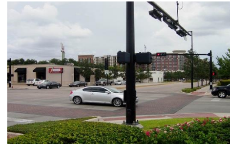
Upper Kirby Management District – Kirby and W. Alabama: before, during, and after infrastructure and streetscape improvements.