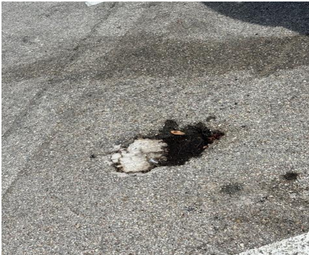
Sinkholes in streets @ Rice Blvd.