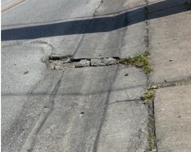
Rundown street conditions @ University