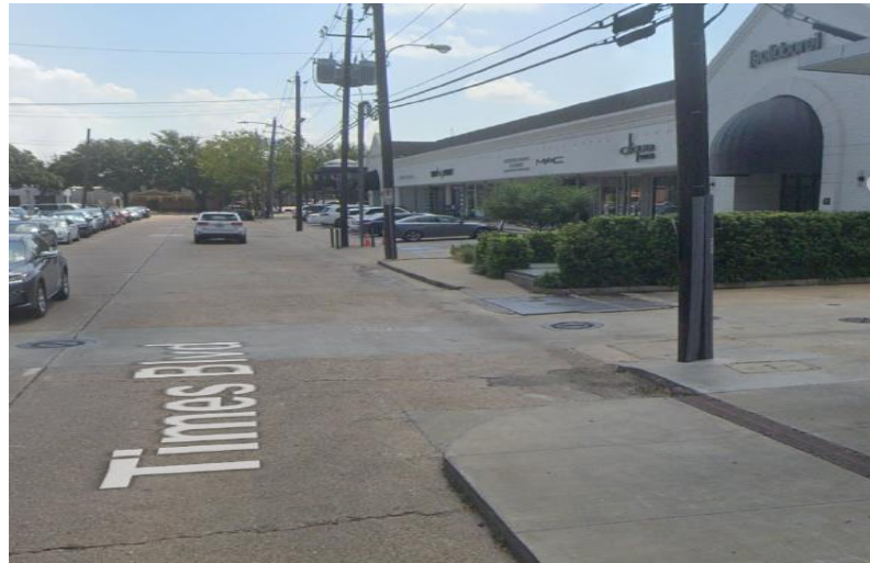
Disparate improvements that inhibit mobility.