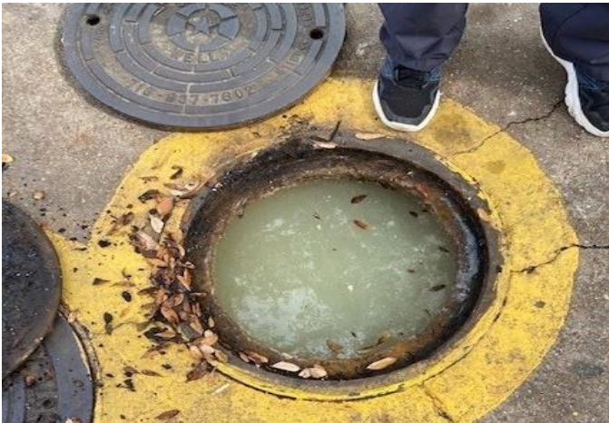
Sewer backup in COH manhole on Morningside Dr.