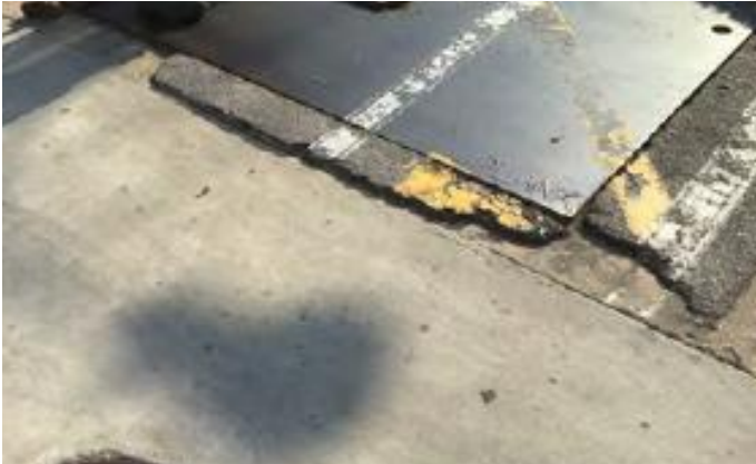
Rundown street conditions @ Times Blvd.