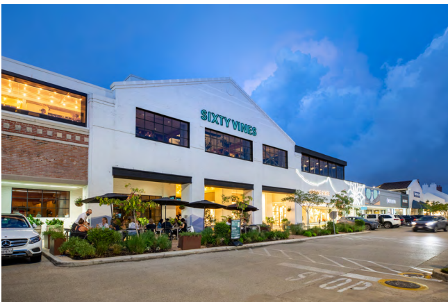
Sixty Vines Exterior

At Rice Village, four-legged family members are always welcome.