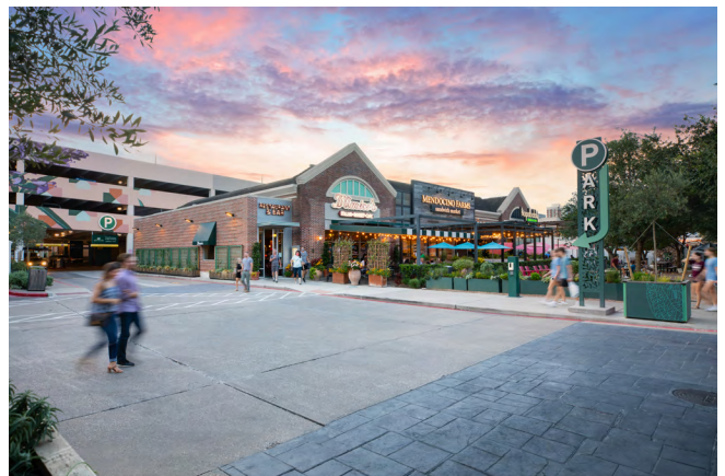
Rice Village Outdoors

Stroll through Rice Village for live, open-air music.