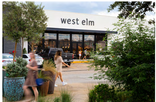
West Elm Exterior

In 2020, New York-based Van Leeuwen opened its first scoop shop in Texas at Rice Village.