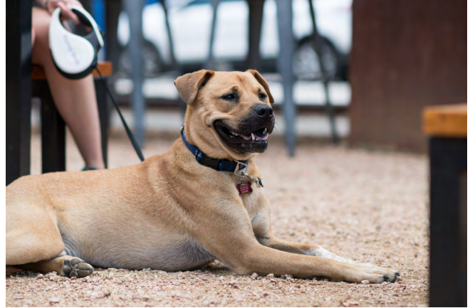
Rice Village Pets

Discover vibrant murals in many of Rice Village's parking garages.