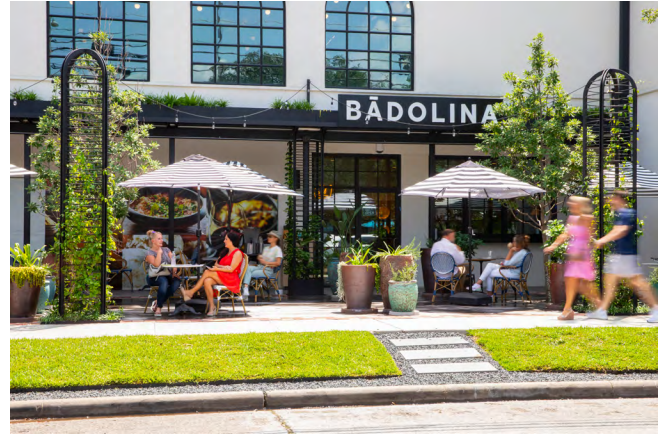
Badolina Outdoor Seating

Shaded outdoor seating makes Badolina Bakery's pastries even sweeter.