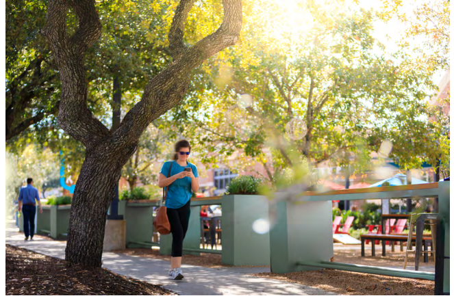
Rice Village Greenery

Popular furniture retailer CB2 is located at the corner of University and Kelvin in Rice Village.