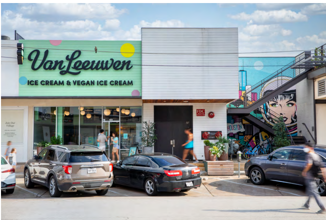
Van Leeuwen Storefront

Rice Village is home to Tecovas's first store in Houston.