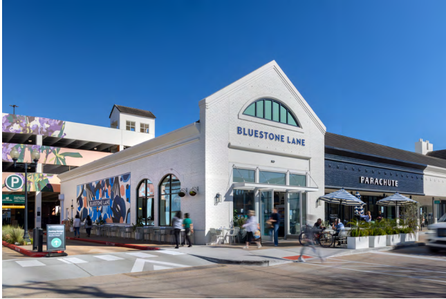
Rice Village Parking Garage