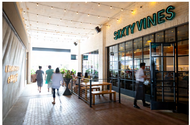
Sixty Vines Walkway

Rice Village remains the home of Sixty Vines's singular Houston location.