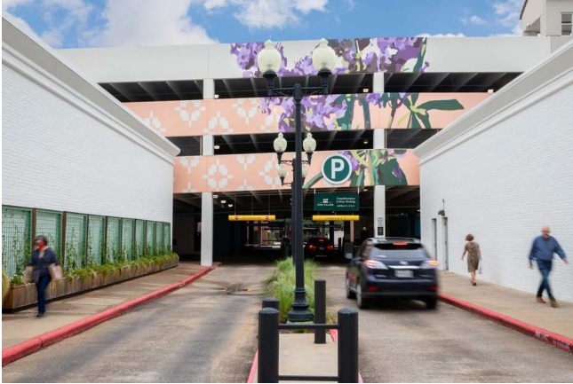
Rice Village Parking Garage