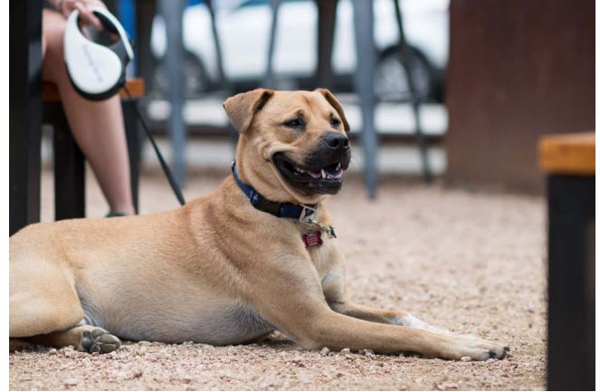
Rice Village Pets

Discover vibrant murals in many of Rice Village's parking garages.