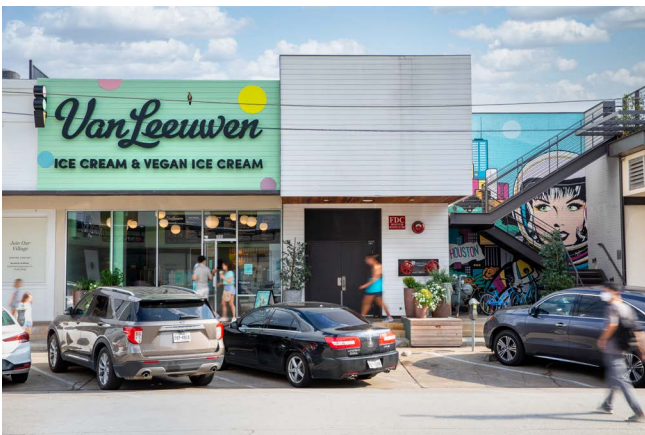
Van Leeuwen Storefront

Rice Village is home to Tecovas's first store in Houston.