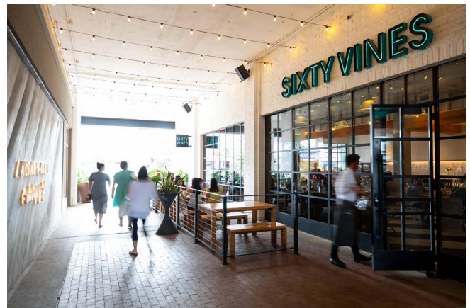
Sixty Vines Walkway

Rice Village remains the home of Sixty Vines's singular Houston location.